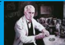
Alexander Fleming, Nobel laureate 1945

“If a cluttered desk is a sign of a cluttered mind, of what, then, is an empty desk a sign?” (Einstein)